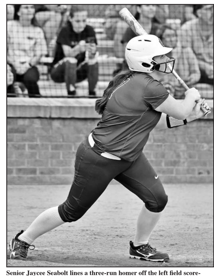
board to end the Fannin game with a 20-5 rout.

Lady Panthers 20, Fannin County 5 (4 in nings ) - One day later, Union County exploded for eight in the fourth, eventually ending the contest via the mercy