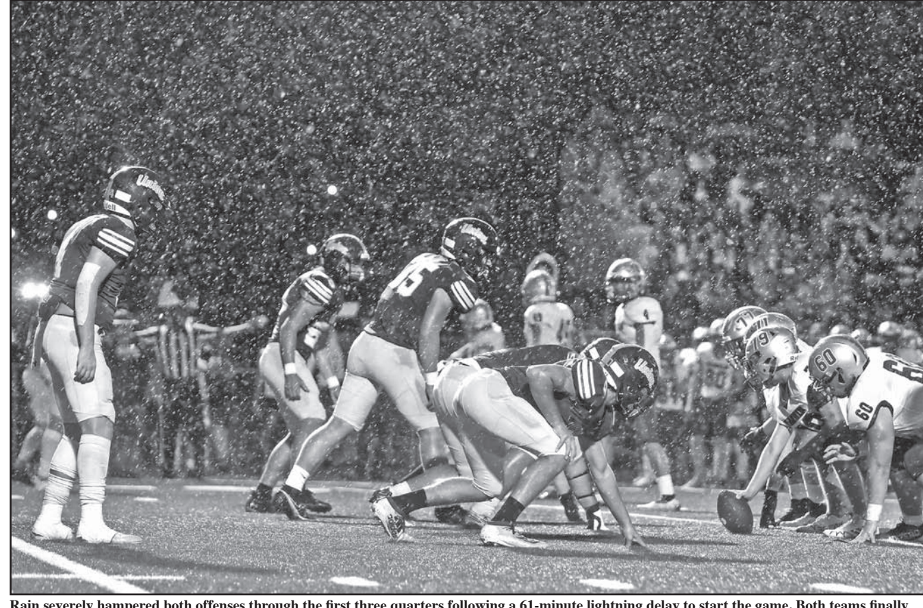
Rain severely hampered both offenses through the first three quarters following a 61-minute lightning delay to start the game. Both teams finally took the field at 8:31 p.m. but the two offenses combined for just 19 passing yards on four completions during the first half. down Tanner's high throw at the a first and goal.

pair of Union touchdowns in the Panthers ahead of the stunned